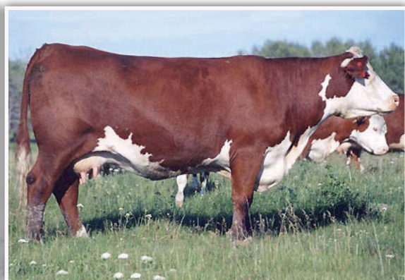
HARVIE MISS FIREFLY 51F - DAM