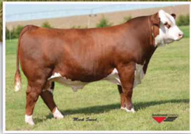
R LEADER 9646 - SIRE