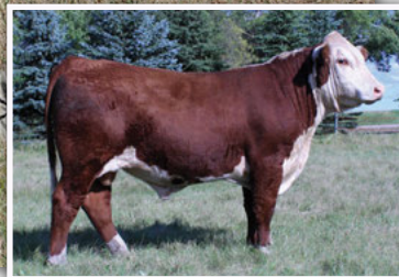
HARVIE AD HARLEN ET 199B - SIRE