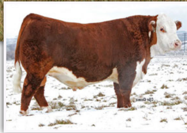
NJW 73S W18 HOMGROWN 8Y ET - SIRE