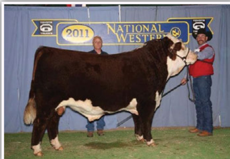
BBSF 101N WRANGLER 29W - SIRE

AI bred to KJ BJ 719Z Truman 659D ET on April 29, 2017. Pasture exposed to Blair's 208Z Titled ET 13C from May 2 to July 16, 2017.