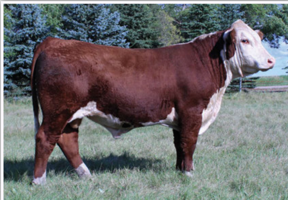
HARVIE AD HARLEN ET 199B - SIRE

• She's a Sparkles!!! If you can remember our first online sale, we had a Sparkles daughter as a feature. Since then we haven't offered many Sparkles daughters and have retained many in our herd. That maternal daughter was purchased by Harvie Ranching, that first year and has been doing a fantastic job for them. Sparkles 24D will be just as great as the first one offered. She's very feminine and stylish in her makeup, long and clean lined and sound. A Harlen daughter that has the service to none other than R Leader 9646, which will result in nothing more than greatness! MHA Field Day Class Winner. AI bred to R Leader 9646 ET on April 29, 2017. Pasture exposed to Blair's 208Z Titlest ET 13C from May 2 to July 16, 2017.