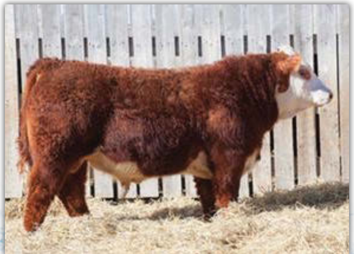
BLAIR'S 208Z TITLEST ET 13C