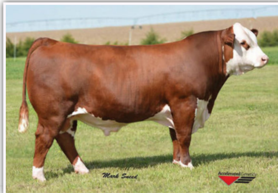
R LEADER - SIRE