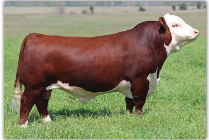
KCL WPF THE PROFESSOR 7110ET - SIRE OF 9B