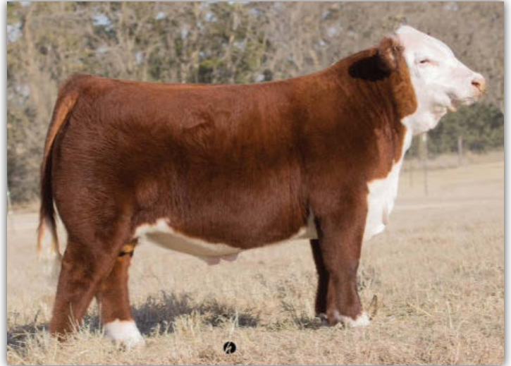
KJ BJ 719Z TRUMAN 659D ET