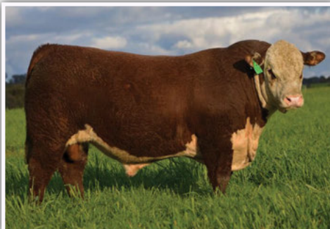
KANIMBLA FULL BOTTLE H117 - SIRE

• A sale feature with powerful donor potential is exactly what this heifer calf is all about. When we had the opportunity to flush RSK Miss Sage 64Y to Full Bottle there was not a doubt in my mind about how good they would be. Full Bottle adds a new outcross to the great Sage cow family and complements Miss Sage 64Y very well. Full of body and power, great shape and strong structured, cherry colored and red eyed, are all embodied in this great heifer calf. The impact that the "Sage" cow family has had on our program and many others has been tremendous. Siblings can be found working for MHPH, LianMor and Hi-Cliffe. MHA Field Day Reserve Champion Heifer Calf