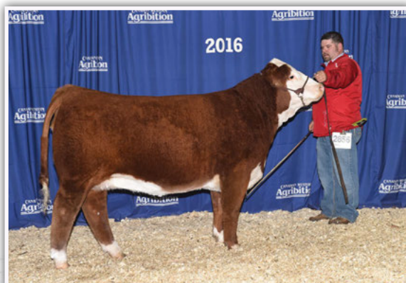
RSK 10Y MISS PRINCESS 31C - DAM