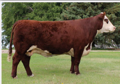
RSK 6U MISS SAGE 64Y - DAM