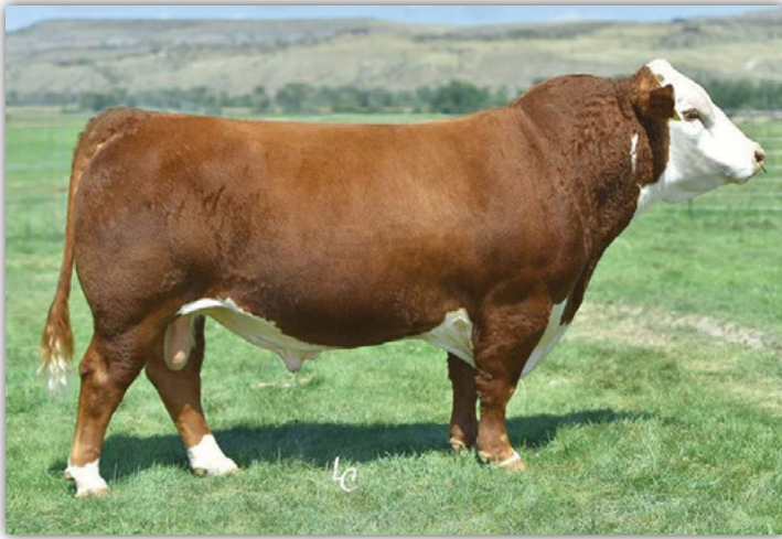
CHURCHILL RED BULL 200Z - SIRE OF 9A