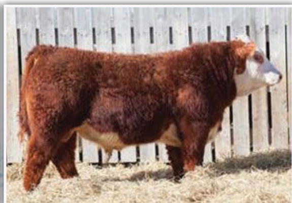
BLAIR'S 208Z TITLEST ET 13C - SIRE