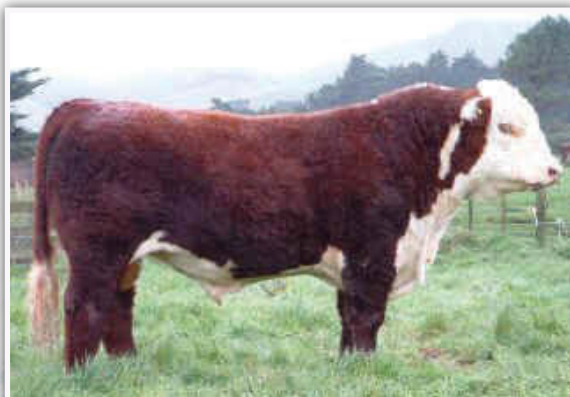
OTAPAWA SKYMATE 2046 - SIRE

Selling 50 doses of US and Canadian qualified semen, in packages of 10 doses. Owned with: Elkhe Herefords, Townsend, MT, USA