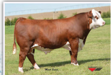
R LEADER 9646 - SERVICE SIRE