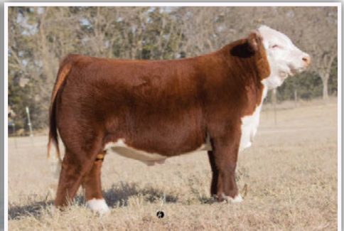
KJ BJ 719Z TRUMAN 659D ET - SERVICE SIRE