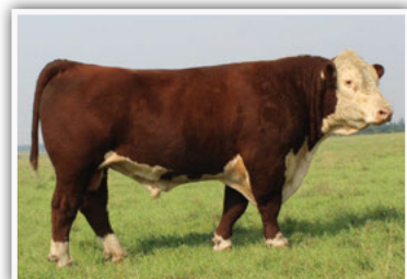
RSK 719T FREESTYLE 4Z - SIRE