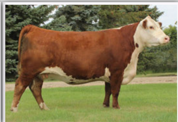
RSK 154U MISS TAMARA ET 28Z - MATERNAL SISTER