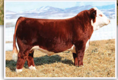
CHURCHILL KICKSTART 501C ET - SIRE

• RSK 4L Ms Princess 1Y has been a head turner for us right from the beginning. She is the definition of a production cow, consistently producing some of the best and heaviest calves in the fall, most going to be featured on our sales. Most notable is RSK 719T Ms Princess 6A, from our first online sale who produced RSK 10Y Miss Princess 31C, who sold for $7000 in last year's sale. Also worth a mention is RSK 4Z Freestyle 74D, the youngest bull in the 2017 EGBs, who had one of the biggest scrotal measurements and indexed 118 and 106 on WW and YW, respectively! It was great decision to include this female in our donor program and we know these matings will be truly special.