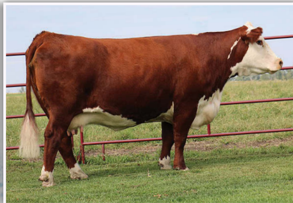
HARVIE MS FIREFLY 125Y - GRAND DAM