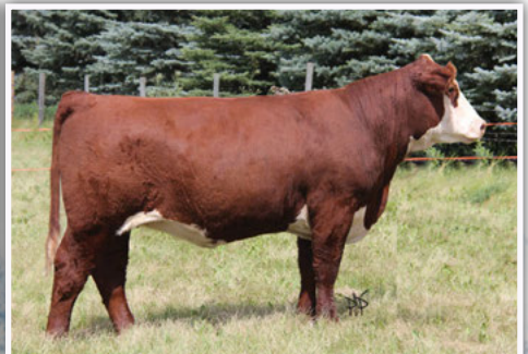
RSK 67C - MATERNAL SISTER - SOLD TO LIAN MOR POLLED HEREFORDS IN 2016 SALE