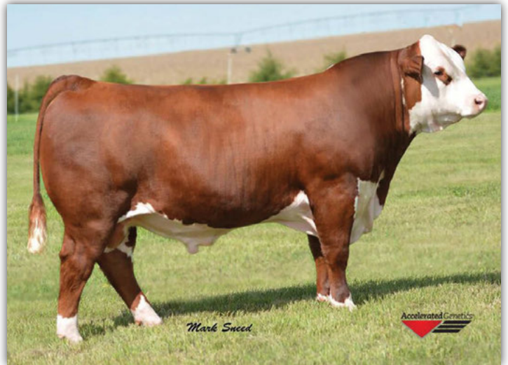
R LEADER 6964